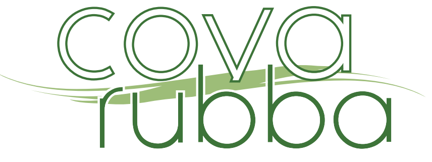
high density - seamless - absorbing